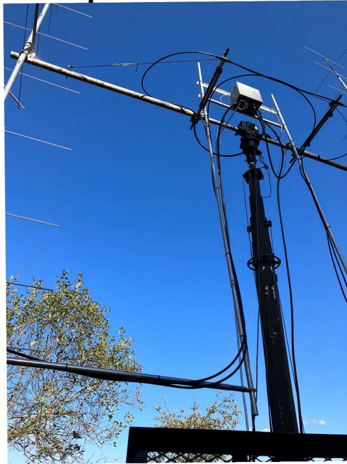
Photo 1. 2m PDs, L-brackets, phasing line loops